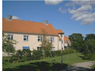
Danida Fellowship Centre, DFC

Danida Fellowship Centre - www.dfcentre.dk - or email to dfc@dfcentre.dk